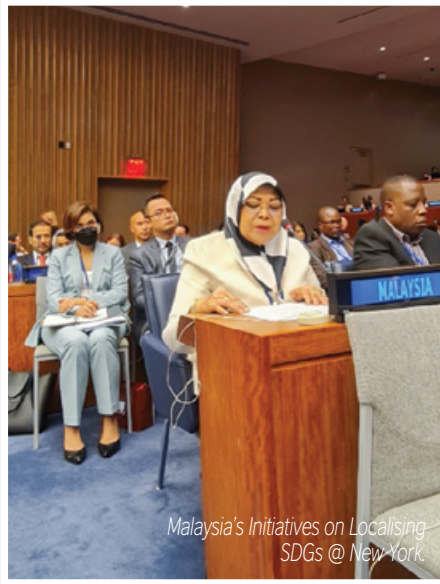
Malaysia's Initiatives on Localising SDGs @ New York.