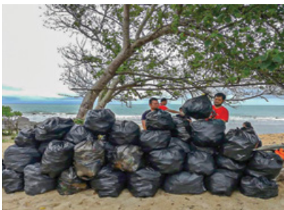
Bags of trash collected from the beach clean-ups!

We need to change our thinking that conservation is a luxurious affair where only certain members of society can afford to be a part of. Most importantly we have to be mindful of what we do every day, like being more considerate of the household wastes that we produce. The simplest action makes the biggest difference. We are part of nature and whatever we do actually in the long run is for our own survival.