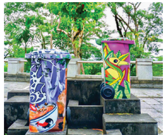
Urbins – making bins attractive.

We can apply the LQC – lighter, quicker and cheaper approach to sustainable community projects, instead of making things so serious and off-putting to people. So, when we talk about Only One Earth , it is not only about the environment, but about the people and our journey together.