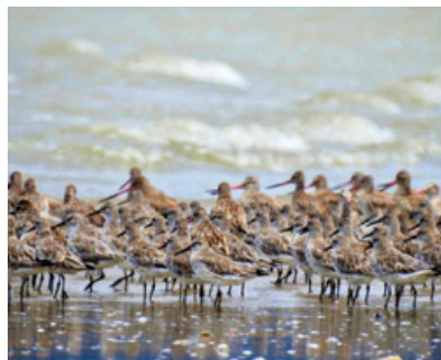
A mix flock of shorebirds ranging from Godwits to Knots.

Sustainable living is very much associated with the quality of our lives. It is about making wise choices from affordable options out there to giving a second life to some items. For example, from recycling activities, we could save and repurpose materials we have for our own use or for the community's use. We all have to play our part in conserving and protecting our environment. Join nature clubs, interact with nature and be more conscious and knowledgeable about the importance of sustainable living. After all, we only have one Earth to call home.