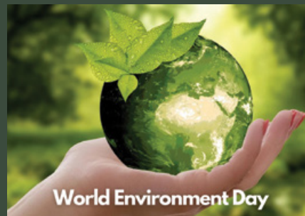
World Environment Day

Extracted from Sarawak, 50 Golden years of Harmony & Prosperity, 2013.