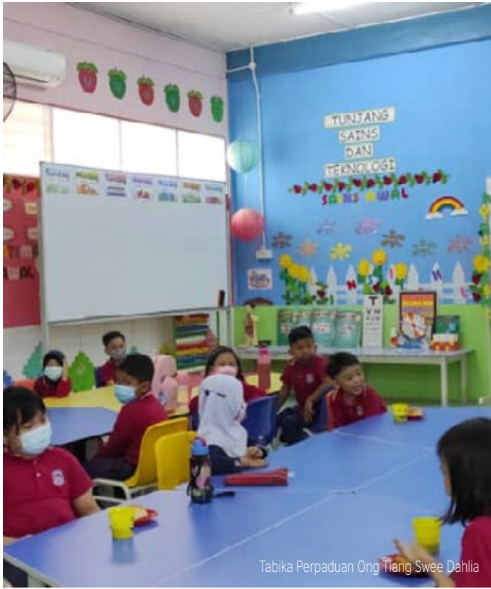
Tabika Perpaduan Ong Tiang Swee Dahlia