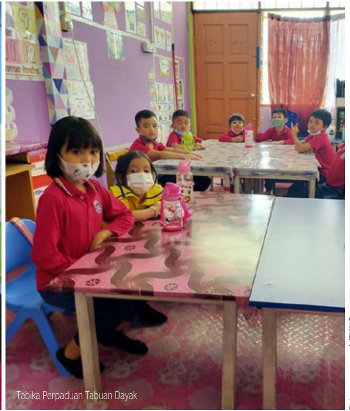
Tabika Perpaduan Tabuan Dayak