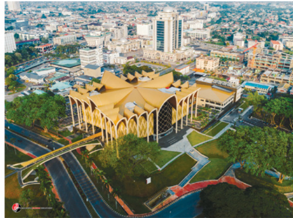
The iconic Borneo Cultures Museum stands proudly in the heart of Kuching city.

By: Sarah Hafizah Chandra | March 3, 2022